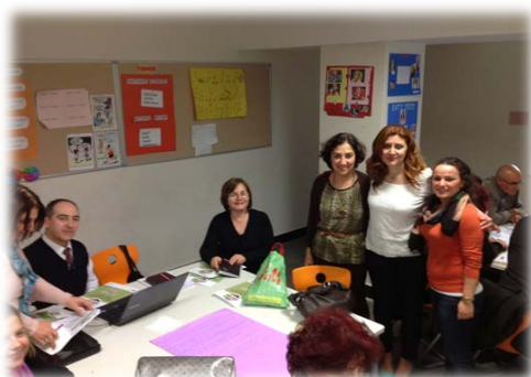
JANUARY 5 th 2013