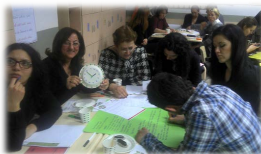
JANUARY 12 th 2013