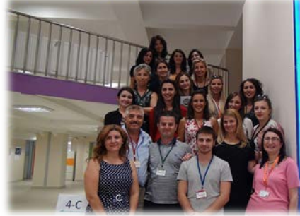
APRIL 6 th ATAŞEHİR DOĞA SCHOOL