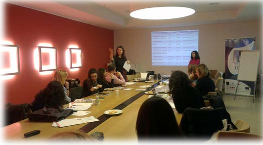
MARCH 28 th 2013 ATAŞEHİR DOĞA SCHOOL