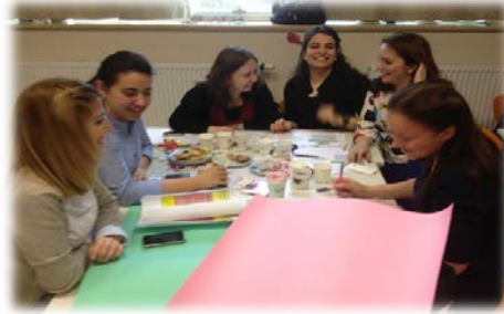
7 th – 8 th FEBRUARY 2013 ATAŞEHİR DOĞA SCHOOL