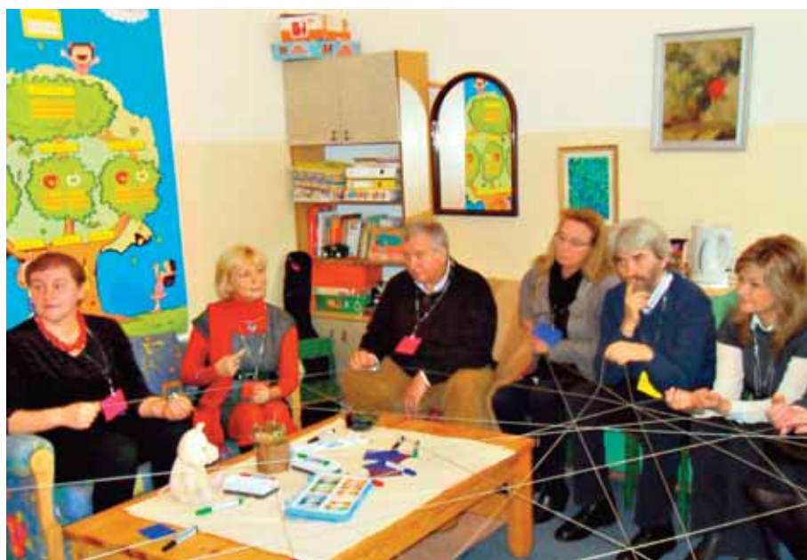
Below: School No 9 in Sopot – a demonstration lesson on practical methods for violence prevention.

During the eSIMTRA 3rd International project meeting which took place in Sopot (Poland) in November 2010 the project experts met with school psychologist and pedagogical advisor and got acquainted with some of the methods and working programs applied in the Polish educational practice. The international guests learned about the „contract” which, in case of violence, can be signed by the pupil and teacher to frame the path to solving the problem. Experts also took part in games developing communication skills and cooperation.